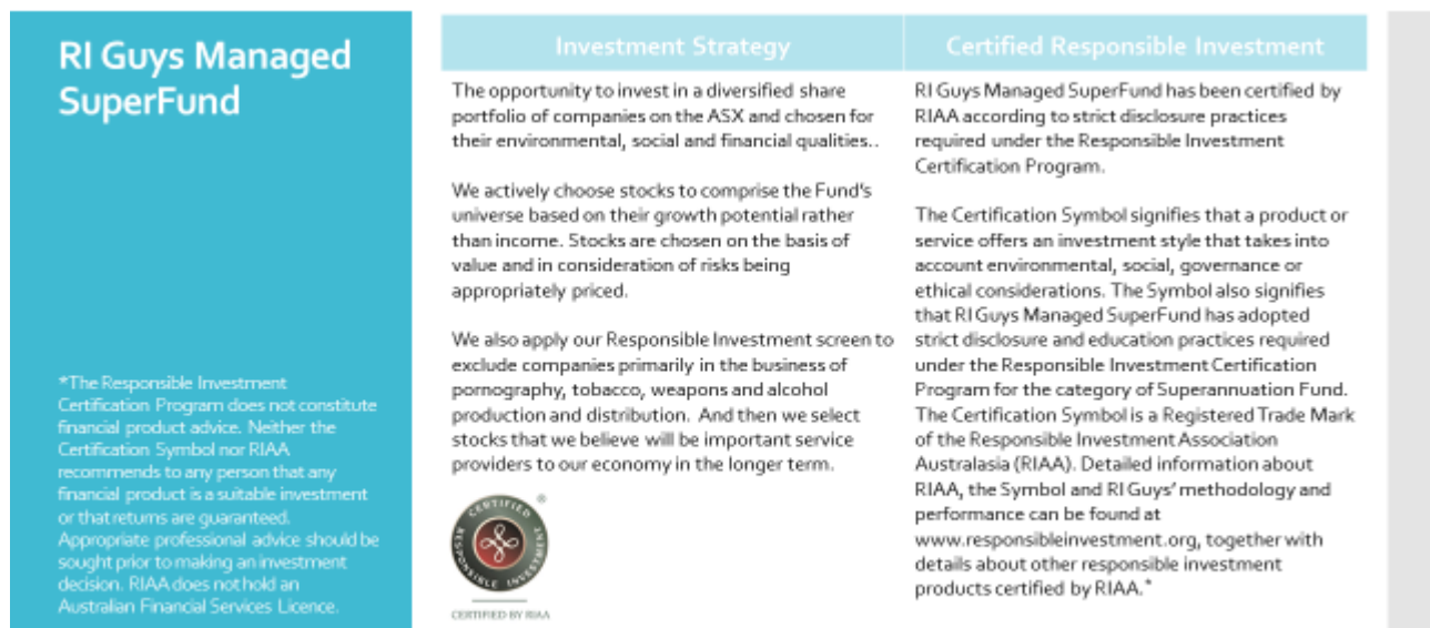
RI Guys Managed SuperFund PDS